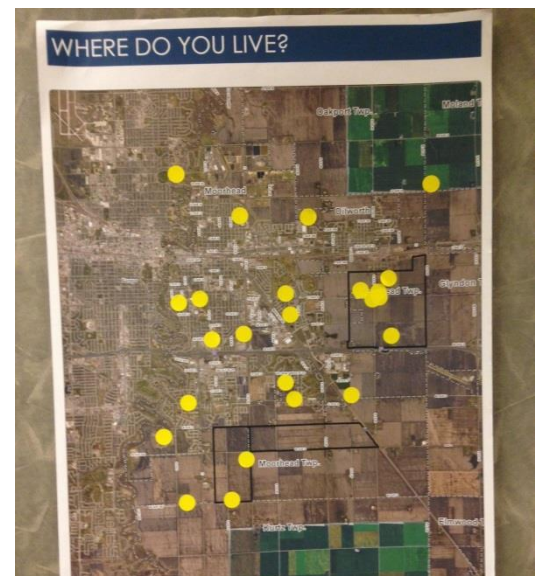
Figure 1 Meeting participants included Moorhead, Dilworth, and growth area residents