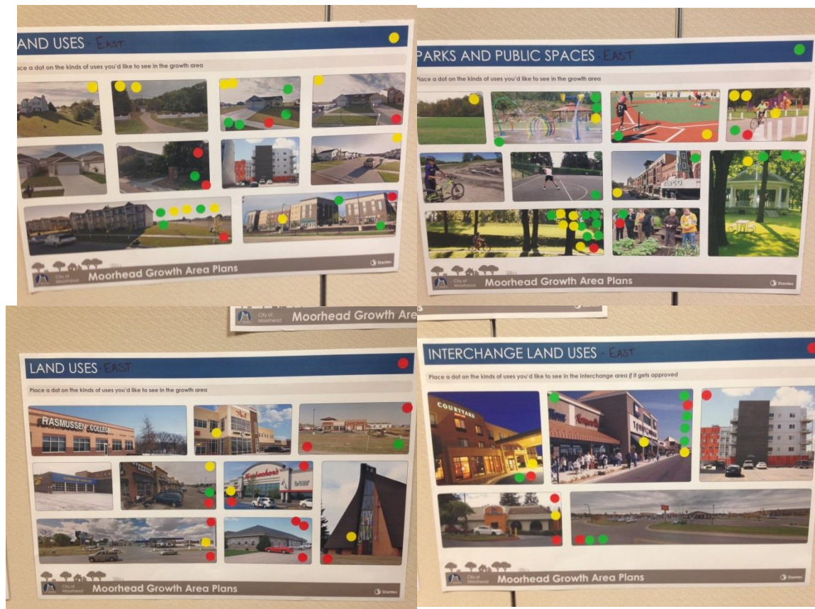
Figure 4 East Growth Area preferred land uses