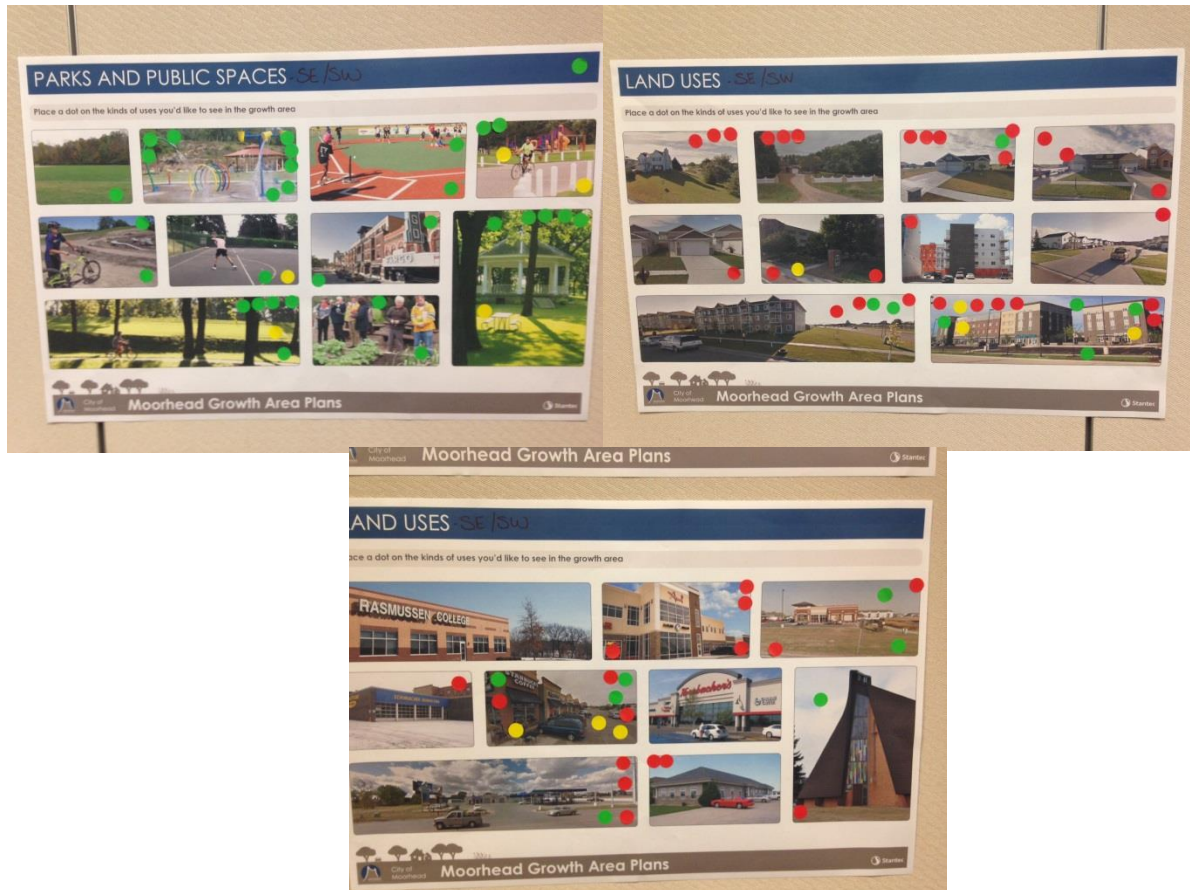
Figure 3: Southeast and Southwest Growth Area preferred land uses