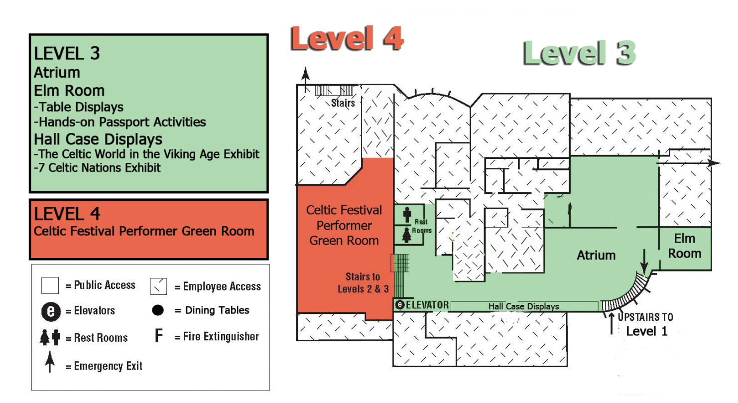
MAIN FLOOR IS LEVEL 1. LEVELS 2, 3 AND 4 ARE LOWER LEVELS.