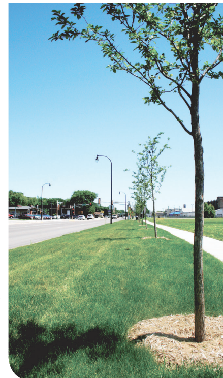
First Ave, Moorhead