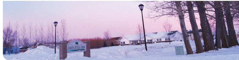
Photo: North Crystal Creek, Oakport

For more information regarding the CodeRED® emergency notification system, please visit us on the web at www.cityofmoorhead.com or call the City Manager's Office at 218.299.5305 .