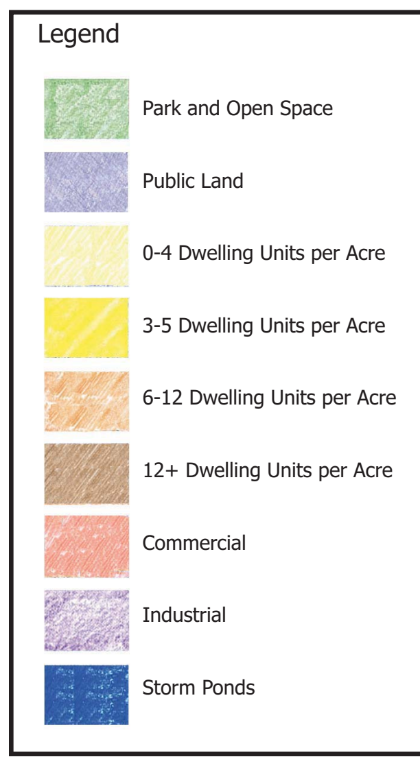
Figure 14:Southeast Growth Area Plan